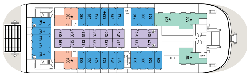
DECK 3 – CABIN DECK