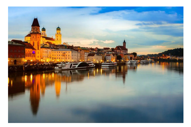
DAY 8 - VILSHOFEN – DISEMBARKATION This morning disembark your ship in Vilshofen. (B)

During the season of Advent, beautiful Passau dresses in her Bavarian holiday splendor, which you will discover on your walking tour through the city and at its Christmas Market at St. Stephen's Square also home to its magnificent cathedral. Go in search of unique crafts, including Bavarian-style houses and glass ornaments. If you prefer a more active adventure, join a guided bike ride along the Danube. Later, sail for Vilshofen, where you'll be treated to an exclusive Oktoberfest celebration. (B,L,D)