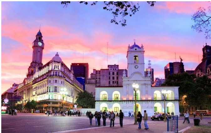
Buenos Aires, Argentina

You will be met and transferred to your deluxe hotel. Remainder of the day is free.