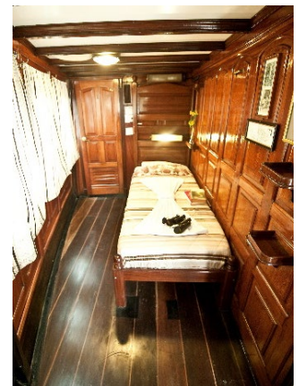
Single - Blue - Cabin