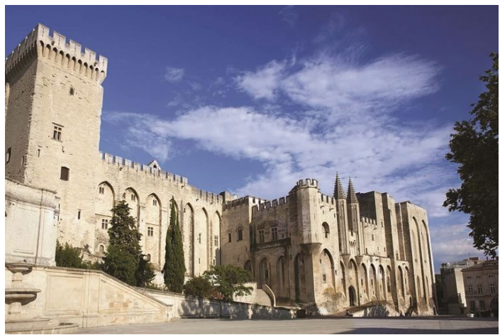
Day 8 ARLES Bid farewell to Arles and prepare for your return flight home. (B)

Avignon, aptly named the "City of Popes," was the center of the Catholic Church in the 14th century when its "Palais des Papes" was the equivalent of today's Vatican. Discover the history of Avignon on a guided walking tour that includes the Papal Palace and the well-preserved medieval walls surrounding the historic center of town, a UNESCO World Heritage Site. Alternately, you can visit three venues around Avignon to taste regional specialties including macarons, cheese and wine, and tapenades. Later in the day, rejoin the ship in Arles, considered one of the most beautiful cities in France. Let your experienced guide lead you to the top sights, including the Romanesque cathedral and Roman amphitheater; or take a guided bike tour to the Roman ruins. If you wish to delve further into Van Gogh's Arles, join a special walking tour along with a visit to the Vincent van Gogh Foundation, showcasing his legacy. Or take some time to focus on wellness with a guided bike tour through town. (B,L,D)