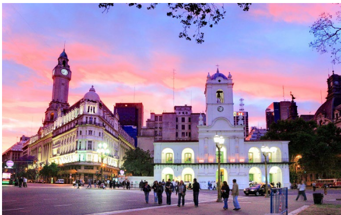
Buenos Aires, Argentina

You will be met and transferred to your deluxe hotel. Remainder of the day is free.