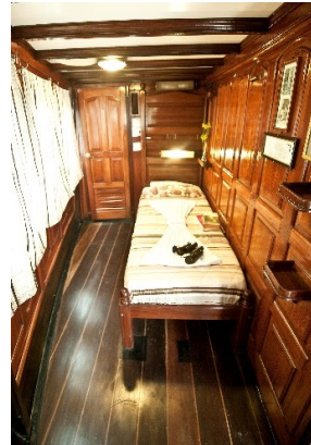
Single - Blue -