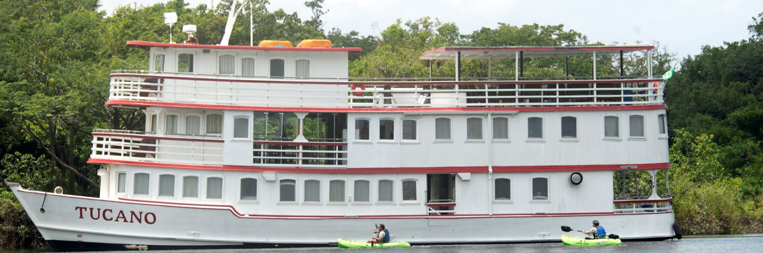
Tucano Deck Plan